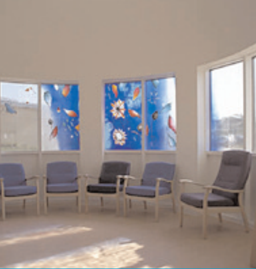
Stained glass by Stuart Low, Older Adult Unit, Callington Road Hospital.