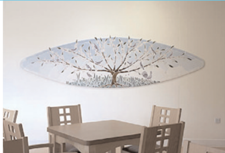
Ceramic panel by Marion Brandis for Adult Acute Units at Callington Road Hospital.