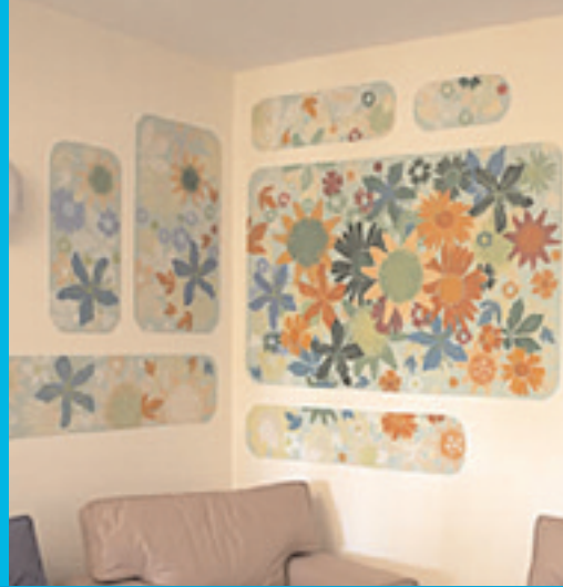
Wallworks by Kiran Chahal for Adult Acute Units, Callington Road Hospital.